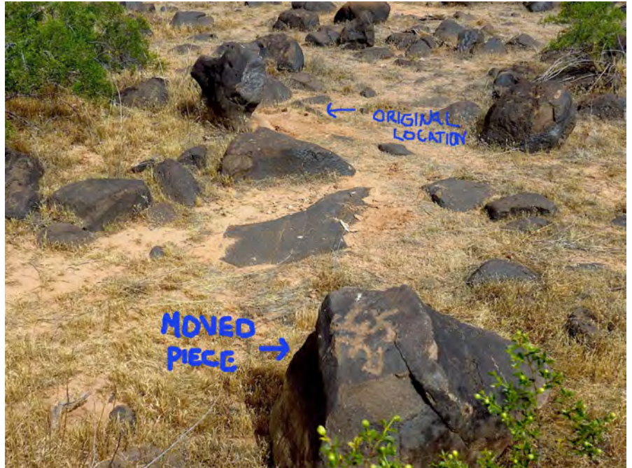
Vantage point of the moved glyph to its original position