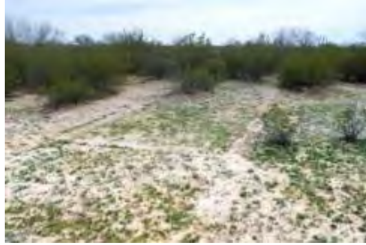
Spring vegetation reveals buried walls.