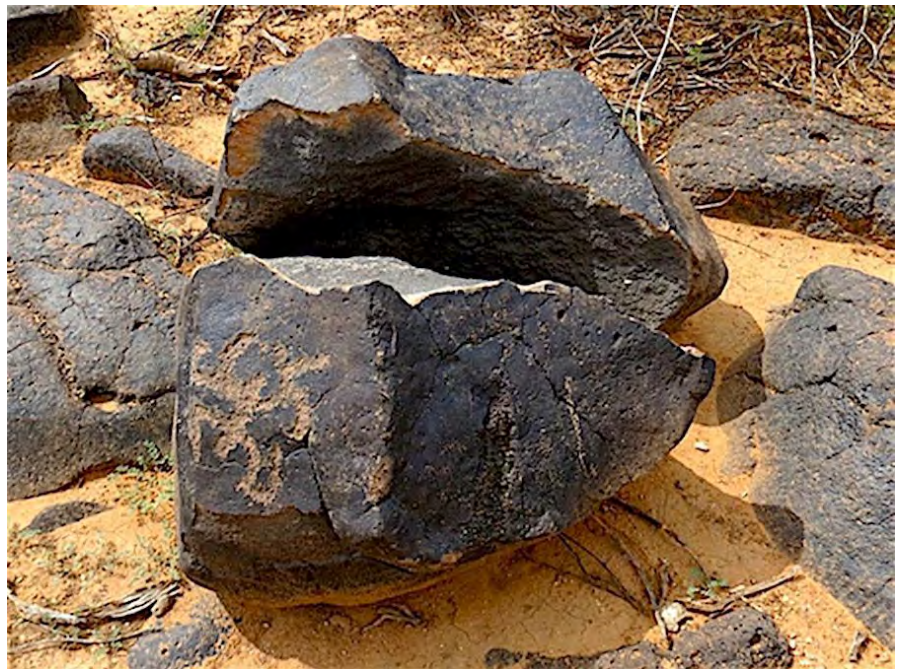
The actual glyph before being moved