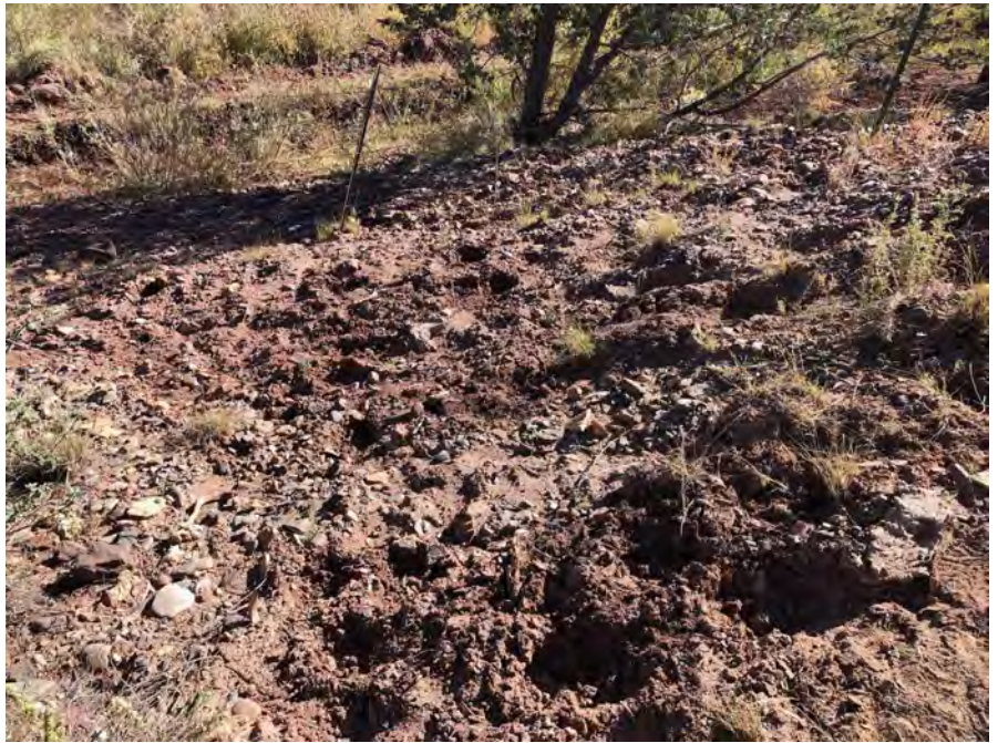
Holes dug by neighboring company at the site